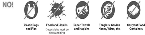
NO! Plastic Bags and Film Food and Liquids (recyclables must be clean and dry) Paper Towels and Napkins Tanglers: Garden Hoses, Wires, etc. Carryout Food Containers

Baltimore City Department of Public Works Bureau of Solid Waste (410) 396-4511 publicworks.baltimorecity.gov/recycling-services Funded in part by THE RECYCLING PARTNERSHIP