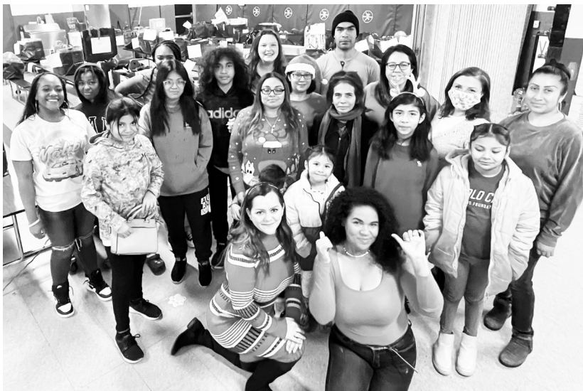
Middle photo: Volunteers in the Holiday Gift Giveaway.

because of a decade long partnership with Baltimore Family Alliance and a first year partnership with the Mix Church of Pratt. Thanks to all!